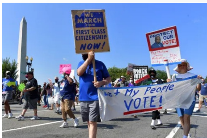
Des Moines Register 8/28/2021

(516) 316-0114 (cell) rnriss@earthlink.net